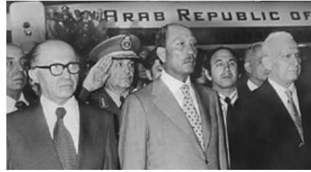
• Sadat’s visit to Israel 1977

from it to ward off accusations of failure or reluctance vis-à-vis Israel, as he was now the “October [War] hero” and Egypt had “fulfilled its obligations” towards Palestine. Sadat visited Israel in November 1977 and signed the Camp David Accords in September 1978, thus putting an end to the conflict between the two parties and regaining the Sinai Peninsula. The Palestine issue thus lost the most active and important party in the conflict against the Israelis, and the prospect of any future large-scale military confrontation with Israel was lessened.