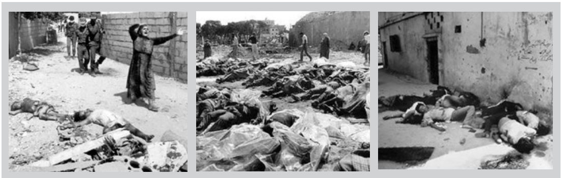
• Sabra and Shatila Massacre 1982