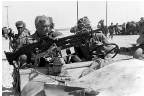
• Ariel Sharon heading to Deversoir Gap in the October War of 1973

The Arab stance at the beginning of that phase was stringent, through the Khartoum conference in 1967 and the participation of Egypt and Syria in a war of attrition with Israel. On 6/10/1973, the Arab-Israeli war (October/ Ramadan War) began , in which Syria and Egypt took part against the Israelis and achieved some early successes.