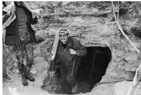
• Yasir ‘Arafat after the battle of Karamah

The period between 1967 and 1970 proved to be a golden era for armed Palestinian resistance, for which borders were opened between Palestine and Jordan (360 km) and Lebanon (79 km). The battle of Karamah, which took place on 21/3/1968 between Palestinian resistance fighters and Jordanian forces on one side, and the Israeli forces on another, led to enormous losses on the Israeli side and represented a big moral victory for the Palestinian resistance. Tens of thousands volunteered to fight alongside the resistance, and Palestinian armed action grew from 12 operations per month in 1967 to 52 per month in 1968, then 199 operations per month in 1969, and 279 operations per month in early 1970. 2