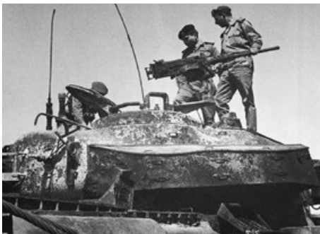
• King Hussein standing on a destroyed Israeli tank after the battle of Karamah

However, the violent clashes between the Jordanian army and the Palestinian resistance in September 1970 and July 1971 led to the exit of Palestinian resistance from Jordan and thus deprived it of one of its most important arenas. The Palestinian resistance was able to strengthen its base in Lebanon, but was forced to battle with the Lebanese army to