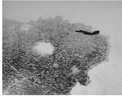
• Israeli plane bombarding Beirut 1982

The 1982 war resulted in 55 thousand Palestinians and Lebanese deaths and injuries, and despite the courage and ability of Palestinian fighters and the failure of the Israelis in crushing the resistance and their leadership, they succeeded in destroying most of the infrastructure of the Palestinian resistance, which no longer posed a serious threat to Israel. The PLO thus found itself far from Palestine and deprived of the ability to carry out military operations from Palestine’s neighboring countries. 4