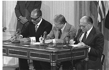
• Camp David Accords Signing Ceremony 1978

Perhaps it is worth mentioning that following the burning of al-Aqsa Mosque, the Organization of Islamic Conference (OIC) was established in 1969 (now known as the Organization of Islamic Cooperation), and was the source of hope for uniting the efforts of Muslims to support the Palestine issue. The OIC held numerous meetings and issued tens of resolutions in support of the Palestine issue politically, financially and militarily. However, its resolutions remained mere ink on paper because they lacked any real and binding implementation mechanisms. Ostensibly, many Islamic states used the OIC as a platform to “vent out” the feelings of their peoples that craved unity and the liberation of the holy sites, instead of adopting any practical and effective programs. What was more, some Islamic states, such as Turkey, maintained relations with Israel, and all the Islamic states held the Palestinian side responsible, as the PLO was “the legitimate and sole representative” and most of them contented themselves with expressing their wish to see Palestine liberated. Some even erected obstacles in order to maintain the status quo. This led to the confinement of the conflict within Palestine and the practical removal of its Arab and Islamic dimensions. The conflicts among the Muslims themselves also negatively affected the role of the Islamic world, such as the Iraqi-Iranian war in 1980–1988, which exhausted the two countries’ energy and resources.