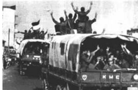
• Departure of PLO fighters from Lebanon