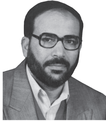
• Dr. Fathi al-Shaqaqi

The Islamic Jihad Movement in Palestine (PIJ) was formed in 1980, and was headed by Dr. Fathi al-Shaqaqi. Its founding members were former members of the MB Movement, and it conducted several resistance operations. The Jihad Brigades (that merged with PIJ) conducted the Mughrabi Gate Operation on 16/10/1986, which killed and injured around 80 Israeli soldiers.