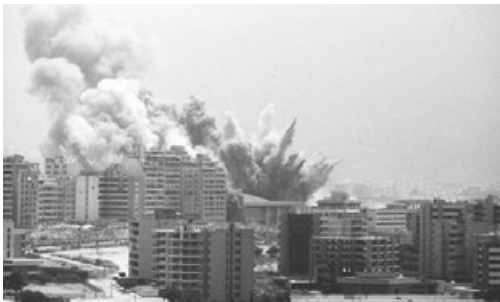
• The Israeli invasion of Lebanon 1982

The Israeli army's invasion of Lebanon in the summer of 1982 was the most violent attack of its kind on Lebanon. Israel was able to invade South Lebanon with relative ease and speed. However, it stopped at the gates of the capital, where it was fiercely confronted by the Palestinian