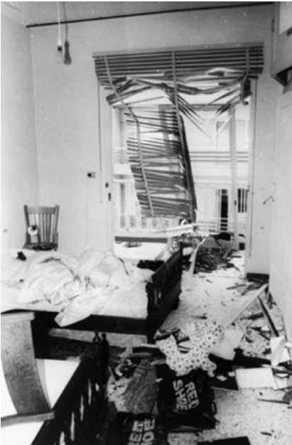
• The assassination site of Kamal Nasser 1973

Israel retaliated harshly against the areas that harbored the Palestinian resistance, both in Jordan and Lebanon, particularly against innocent civilians and civilian infrastructure, including factories, bridges, power plants, and even agricultural crops. In Lebanon, the Israelis led intense campaigns on al-‘Orqoub (1970–1972) and assassinated three PLO leaders on 10/4/1973, Muhammad Yusuf al-Najjar, Kamal ‘Adwan, and Kamal Nasser. They also conducted a broad invasion in the South of Lebanon in March 1978, in which they succeeded in creating a buffer zone on Lebanese territory with the help of Sa‘ad Haddad, a Lebanese ex-army officer who led the South Lebanon Army, a military faction that collaborated with Israel.