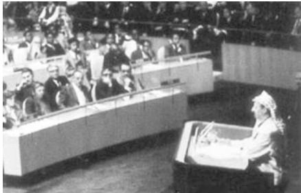
• Yasir ‘Arafat at the UN 1974

In order to avoid the wave of popular anger and to overcome the feeling of hopelessness resulting from the 1967 War, Arab regimes had to open the way for Palestinian resistance action, which was able to build a strong and broad base in Jordan and Lebanon. Palestinian resistance organizations, led by