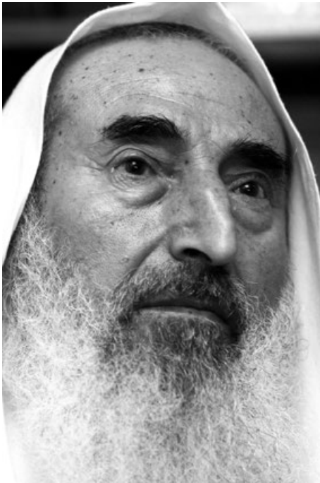
• Sheikh Ahmad Yasin

In 1980, the secret organization Usrat al-Jihad (lit. The Family of Jihad) was uncovered in the land that was occupied in 1948 “Israel,” and around 60 of its members were arrested after conducting several operations.