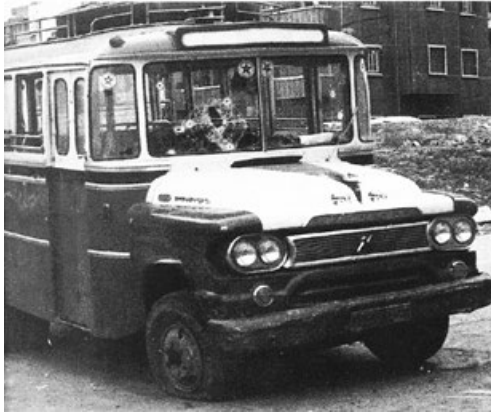
• The ‘Ain al-Rummaneh bus incident, the spark that ignited the Lebanese Civil War in 1975

achieve this, before the Cairo Agreement was concluded in November 1969, which allowed the resistance to conduct armed operations through Lebanon.