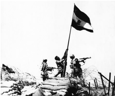
• The hoisting of the Egyptian flag in the October War of 1973

The Egyptians were able to advance towards the eastern part of the Suez Canal and penetrate into Sinai, while the Syrians were able to penetrate the Golan Heights. However, the Israelis soon benefited from a US airlift and took control, breaking through the western part of the Suez Canal (Deversoir Gap) and