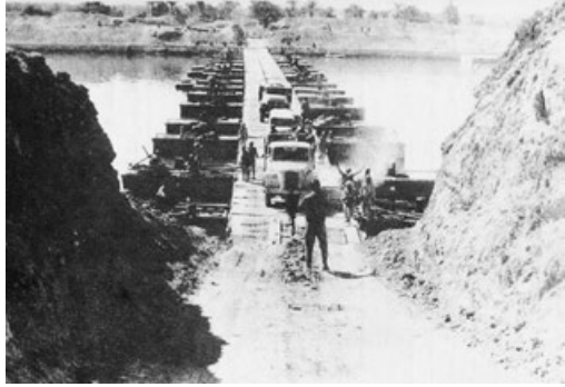
• Egyptian forces crossing the Suez Canal in the October War of 1973

Yasir ‘Arafat was expelled from Damascus and an attempt was made to end the presence of his supporters in North Lebanon, especially in the Nahr al-Bared and Baddawi refugee camps that same year. This was in addition to the enmity with the greatest Arab power, namely Egypt (especially in 1977–1983) after it accepted the principle of a peaceful settlement and signed the Camp David Accords with Israel. Meanwhile, Iraq was occupied with its war against Iran in 1980–1988 and was thus unable to exert any serious influence on the development of the Palestine issue.