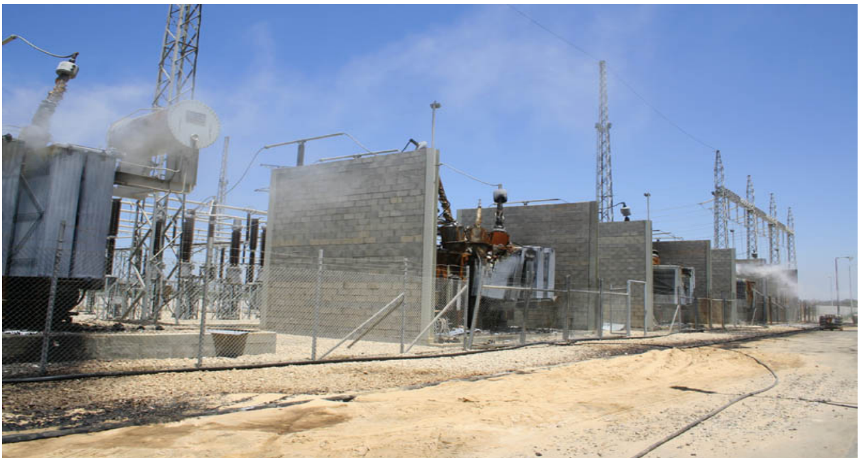
The smoking remains of the transformers of the Gaza power station following Israeli airstrikes on June 28, 2006.